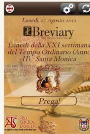
Free Liturgy of the Hours for phone/tablet