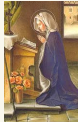
St. Gertrude the Great

This is the one used by Saint Leo Abbey monks. There is a paid version by another