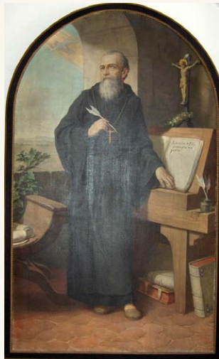
Rule of Saint Benedict